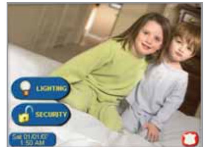
Custom End-User Screen